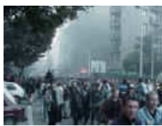
of the Belgrade Coup